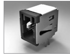
0.50 Header (H)