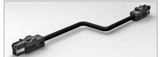
0.50 HSL Harness